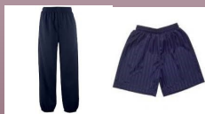
Navy jogging Bottoms or shorts