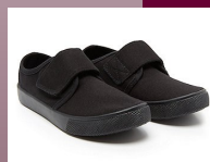
Black Plimsolls (with Velcro, NO laces)

PLEASE ENSURE THAT EVERY PIECE OF CLOTHING IS CLEARLY LABELLED WITH YOUR CHILD'S NAME.